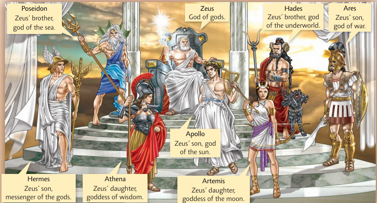
Poseidon Zeus' brother, god of the sea.

3 Zeus, from Greek mythology, has a family full of gods. Listen and read the text to meet some of them.