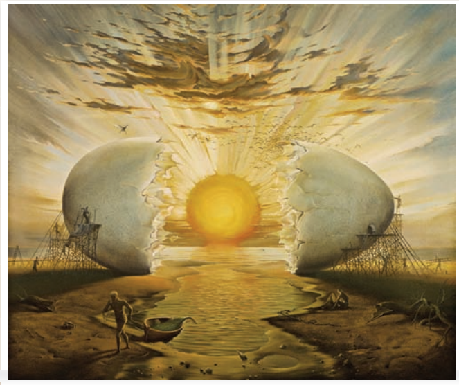
By Vladimir Kush

It is an artistic movement from the 1920s that first appeared in Paris and had, as its objective, to use the unconscious in the creativity process. This is why surrealistic paintings may sometimes seem crazy, because it comes from the imagination, where everything is possible.