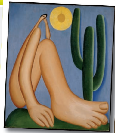
ART: AMARAL, TARSILA DO ABAPORU, 1928 ÓLEO SOBRE TELA, C.I.D. 85 X 73 CM. COLEÇÃO COSTANTINI, BUENOS AIRES, ARGENTINA. TARSILA DO AMARAL EMPREENDIMENTOS / REPRODUÇÃO FOTOGRÁFICA ROMULO FIALDINI.

Now, create a sentence about this picture. Use one or more words from the list. Follow the example: